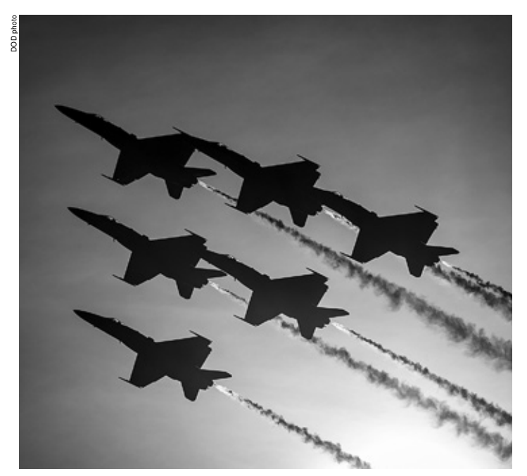
Blue Angel Hornets fly in formation at an air show in 2014.